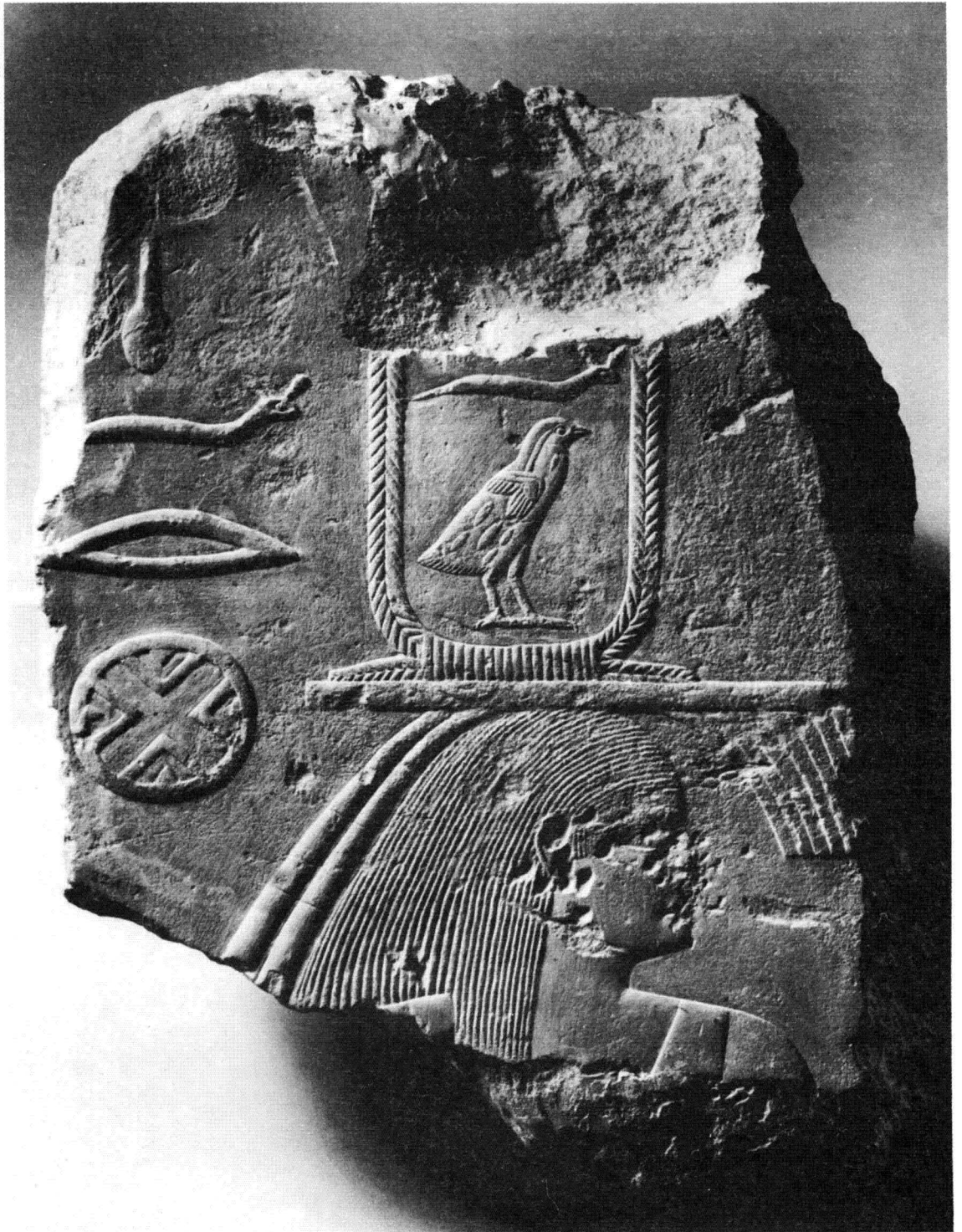
Plate II: Head of a Female Personification of an Estate The Metropolitan Museum of Art, New York (22.1.7) Rogers Fund and Edward S. Harkness Gift