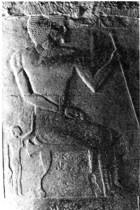
Plate IB: The Mastaba of Khufu-khaf I East wall of main offering chamber Eastern Cemetery, Giza (G7130/7140)